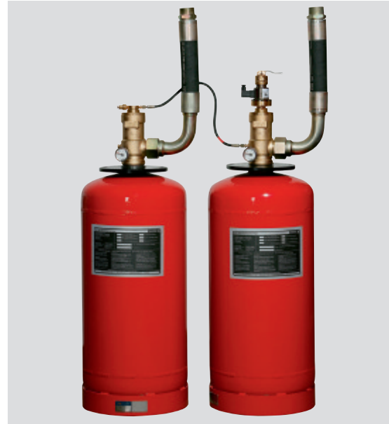
Example of a multi-cylinder system